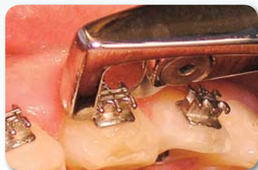
Converting SWLF Synergy R bracket to Synergy style bracket with cap conversion pliers.